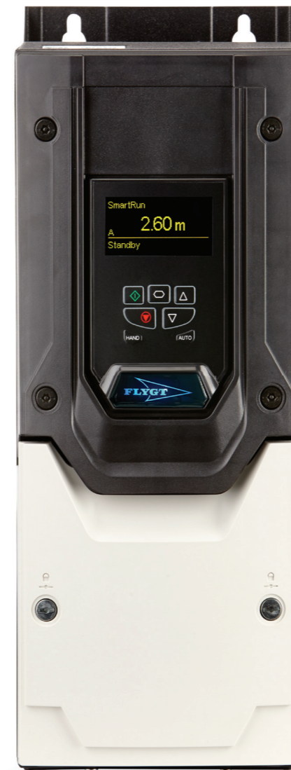
SmartRun: an efficient, pre-programmed way to ensure optimal performance for your Flygt N-pumps.