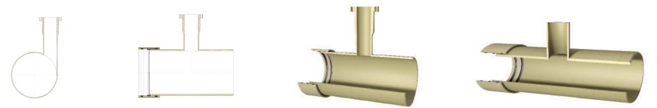
CONCENTRIC & TANGENTIAL TEE